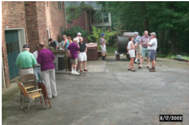
Lions start to gather for the steak fry.