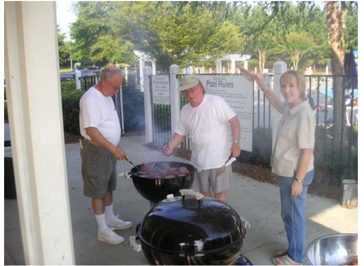
Another delicious dinner thanks to our master chefs!