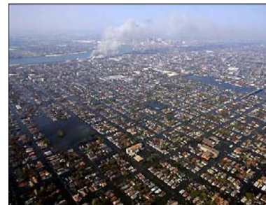
Over 80% of New Orleans was flooded after Katrina – August 29, 2005

Hurricane Katrina struck the Gulf Coast states of Louisiana, Mississippi and Alabama on August 29 th and will undoubtedly go down in history as one of the worst disasters in United States history, rivaling the legendary status of the San Francisco earthquake and the Galveston hurricane of 1900. With whole towns devastated, thousands of families displaced by the hurricane and the subsequent flooding of New Orleans, an unprecedented number of Americans are in need. At least half a million people are homeless and many have lost everything they own. Damage estimates are in excess of $100 billion and climbing every day. Despite the challenges involved, once again the Lions of the United States have stepped up to the daunting task of supporting those in need with renewed hope and vigor.