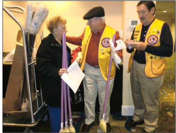
Brooms & Mops are G-O-N-E!