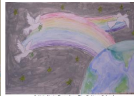
Artist: Kyrie Dumphy - The Cottage School